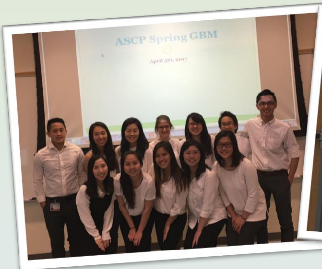
ASCP 2016-2017 Executive Board