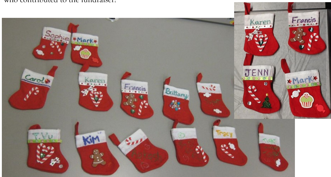
The finished product—several beautiful stockings ready for delivery to their lucky recipients.

The Rocking Stockings Fundraiser this year was a success. The fundraiser provided a great time of decorating the stockings with bubble paint, stickers, glitter glue, ribbon and gems! Each stocking was personalized and filled with delicious candy for students to munch on while they study for finals. This year ASCP sold 105 Christmas stockings and raised $249.55. This was all possible with the support and generous donations from the students at SKAGGS. We would like to say thank you to all who contributed to the fundraiser!