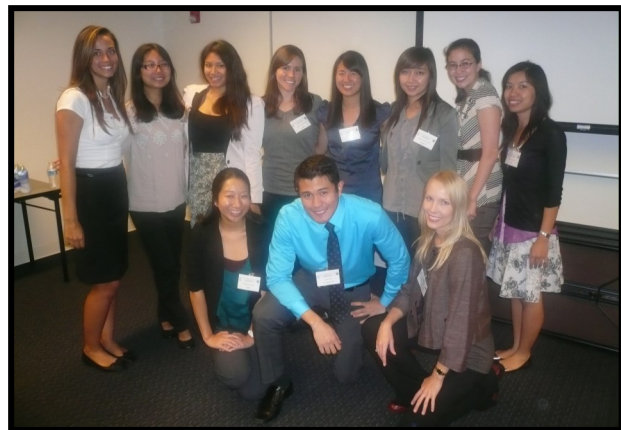
UCSD-ASCP Executive Board 2012-2013