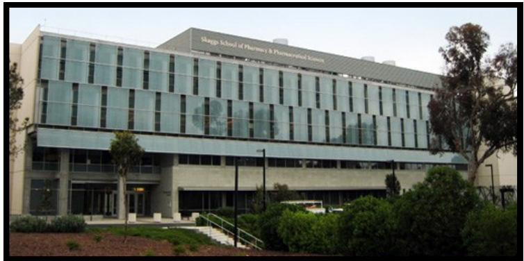
Skaggs School of Pharmacy and Pharmaceutical Sciences at UC San Diego