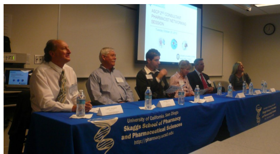
Panel of consultant pharmacists

We would like to thank the pharmacists who participated in our networking session and we look forward to hosting another one next year to enlighten students about career paths in geriatric pharmacy. Many thanks also to our sponsors (Sprinkles, Vons, Fresh and Easy and Sprouts) for donating snacks, desserts and refreshments!