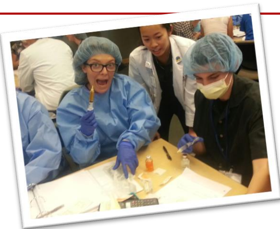
Top and Middle: Students learn how to inject fluids into an IV bag.

On July 17 th , 2015, various organizations at Skaggs School of Pharmacy came together to collaborate with Rady Children's Summer Medical Academy. The school created a fun-filled day consisting of various events that exposed high school students to the exciting roles of the pharmacist. The events covered a wide breadth of topics: Clinical Pharmacy (dose adjustments, IV medication preparations, code blue), Medication Management (diabetes, asthma, medication safety), and Compounding. UCSD-ASCP specifically help create the medication safety portion of the activities, which included organizing Aunt Betty's medications. The high school students had to identify the medications that Aunt Betty has been taking. Then, they choose the appropriate medication for each of Aunt Betty's disease states. The activities guided the students towards better understanding issues surrounding polypharmacy and the geriatric population.