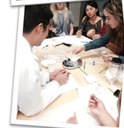
Left Upper Quadrant: Student learns how to use inhalers. Right Upper Quadrant and Left Lower Quadrant: Students compound chap stick. Right Lower Quadrant: Student displays a completed chap stick.