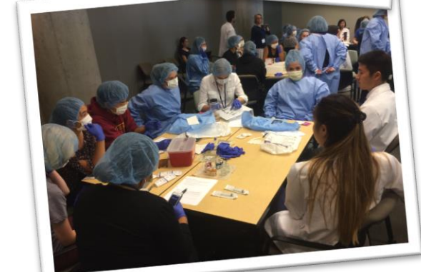
Top and Bottom: Students practice preparing IV medications.