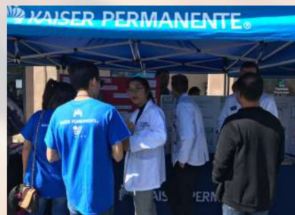
At our booth, students were actively engaged in educational conversations.

On December 4th, ASCP held our second annual DIY Hot Cocoa Jar fundraiser in the Fall quarter, in preparations for the coming holiday celebrations. Many jars were purchased as gifts for friends, bigs, and faculties to show appreciation to them. Participants had a great and fun time putting the jars together, listening to holiday tunes, and enjoying hot chocolate as refreshment. A great big thanks to everyone who helped and supported ASCP's fundraiser and contributed to another successful year!