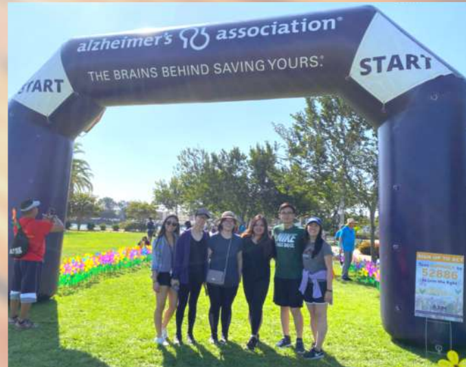
The participated board members

ASCP collaborated with CPNP and participated in the 2019 Walk to End Alzheimer's held at Liberty Station in San Diego. Our organization members fundraised for the event and walked to raise awareness about Alzheimer's disease. It was my 2nd year in a row attending this event; last year, we hosted a table with educational poster boards regarding insomnia and osteoarthritis while this year, we signed up to walk and raise money. It's always rewarding to participate and support this cause whether as a volunteer or as a walk participant. I hope ASCP and CPNP continue to be involved in the Walk to End Alzheimer's and help raise money towards finding a cure!