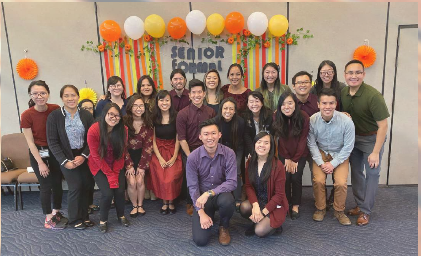
Participating ASCP/APhA members and volunteers.