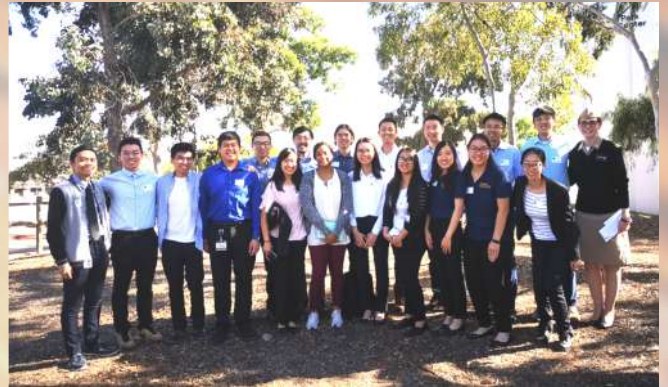
The participated students

During the tour, we got to see how the world of pharmacy is organized into different areas of expertise to better the health of patients who serve our country. On the naval base, pharmacists were able to be in an inpatient, outpatient, or ambulatory care setting. Because they serve so many patients, they are well staffed and have many medications on hand for their patients. One does not have to be a member of service in order to work in the naval base. Civilians can also join the team and assist patients. I would recommend this tour again for next year.