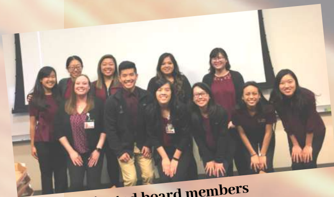
The participated board members