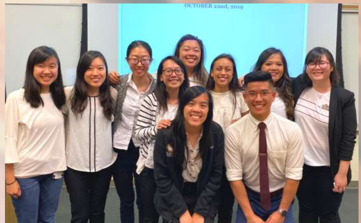
The participated board members