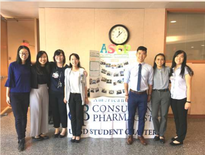
The participated board members

ASCP started out the 2019-2020 school year by taking part in the annual UCSD Organization Fair. We were so excited to meet the first year students, as they will be our new potential members in the near future. We were able to showcase our organization through answering many questions. Information was given about the community that our organization focuses on, and the events we hold throughout the year. Overall, we successfully recruited many new ASCP members for this year, and were excited for what they were planning to bring to our chapter!