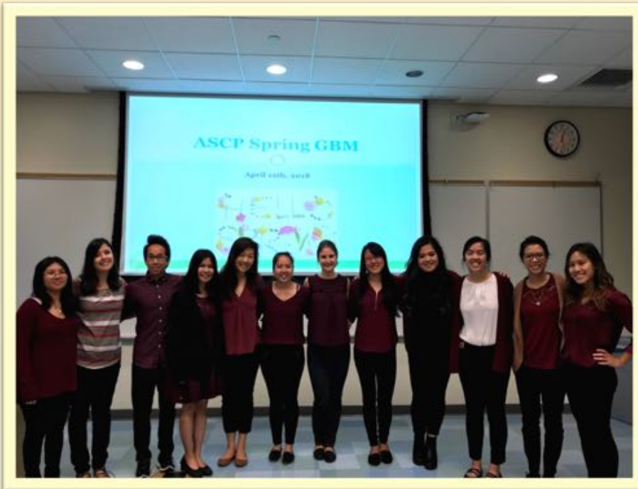
2017-2018 ASCP Board