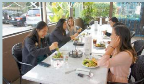
From top/bottom and left/right: 1. lobster pizza served at banquet. 2. Members eating at their table. 3. UCSD-ASCP 2018-2019 board. 4. UCSD-ASCP 2019-2020 board. 5. Members eating at their table