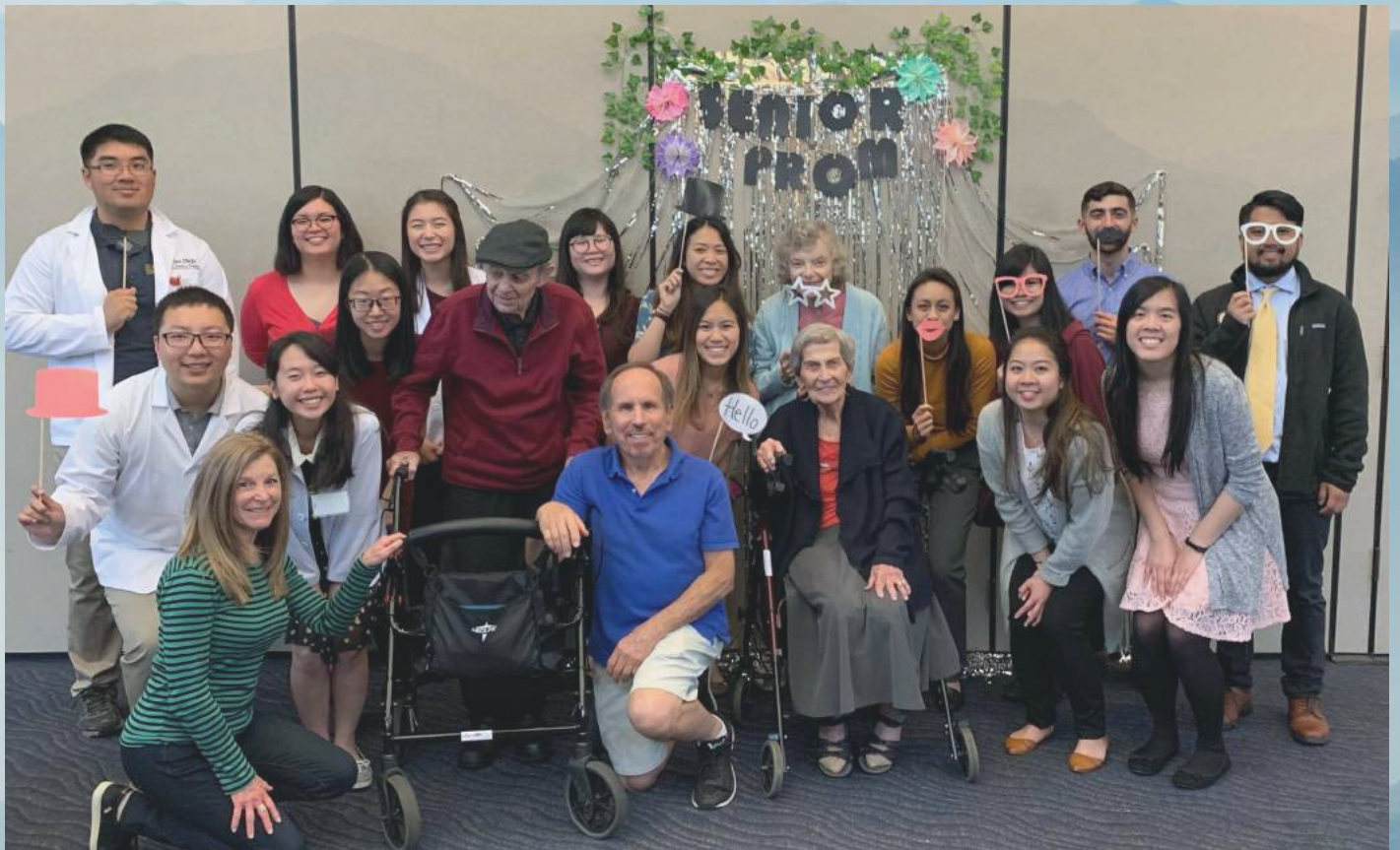
Senior Residents, ASCP members, and volunteers.