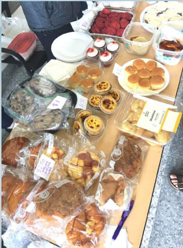
The bake goods donated by members.

On May 31st, ASCP held its annual Spring Bake Sale in Skaggs Lobby during lunch time. Students donated many baked goods, some includes homemade mini cheese cakes, strawberry cream cupcakes, and also banana breads. Students also purchased baked items to donate. All the desserts were delicious! Students, staff, and faculty were able to enjoy the amazing and delicious treats donated by our very own ASCP members. A big thanks to all the generous baked goods donors and also to everyone who helped contributed to ASCP's fundraising by purchasing the baked goods. The money raised went towards future ASCP events.