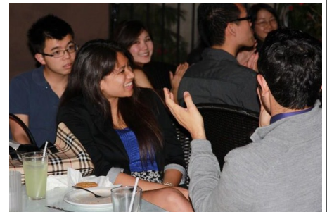
UCSD-ASCP Banquet Leucadia Pizzeria May 23rd, 2012