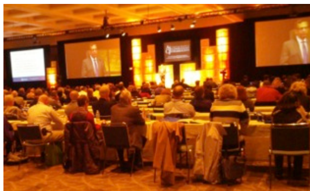
At the Public Policy Lecture