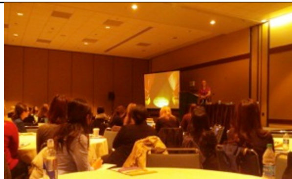
At the “Jump on Board and Set Sail to a PGY-1 Pharmacy